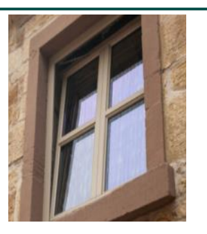
Tilt & turn window