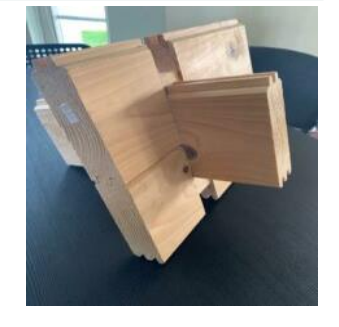
Interlocking wall system