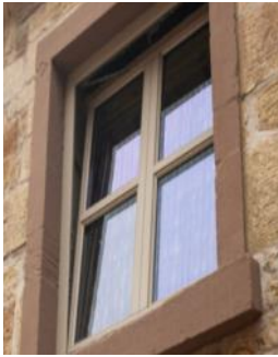
Tilt & turn window