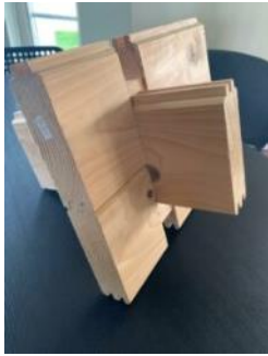
Interlocking wall system