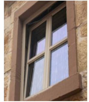
Tilt & turn window