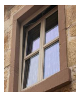
Tilt & turn window