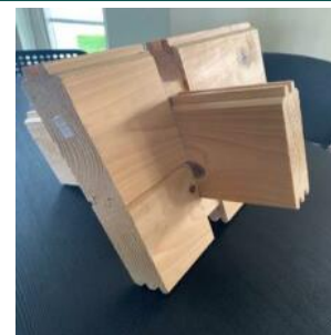
Interlocking wall system