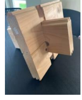
Interlocking wall system