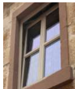
Tilt & turn window