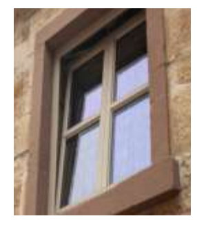
Tilt & turn window