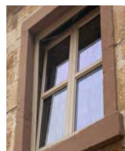
Tilt & turn window